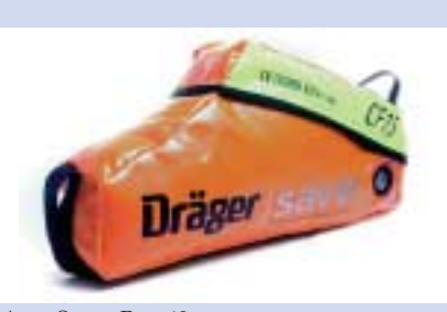
Anti-Static Bag 10min (order code:- 335 0646) Anti-Static Bag 15min (order code:- 335 0647)

(order code:- 338 0164) (order code:- 338 0165) (order code:- 338 0166) (order code:- 338 0167)